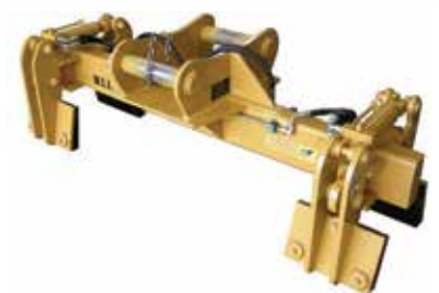
POINTS BEARER GRAB

An efficient method for unloading and moving sleeper stock up to 12 sleepers from a standard pack.