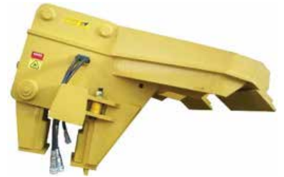
PLATYPUS - WIDE BLADE

Have been designed to simplify and speed up the safe replacement of railway sleepers. The grab picks up and side inserts concrete sleepers under the rail line. This product allows for a fast and efficient method and saves manual handling, time and money.