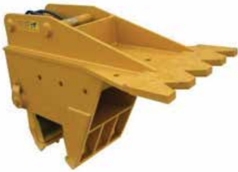
PLATYPUS - STANDARD