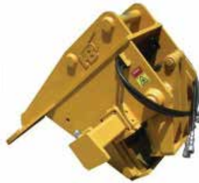
PLATYPUS - CLIP PUSHER