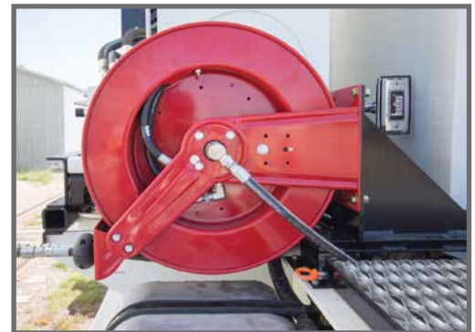
Spare tool circuits