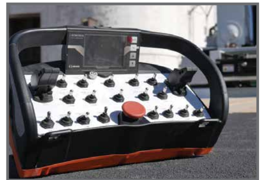
Remote Control Technology