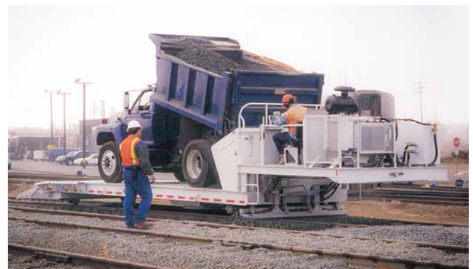
Ballast spreading hopper attachment

Specifications subject to change without notice. Contact DymaxRail for control group details