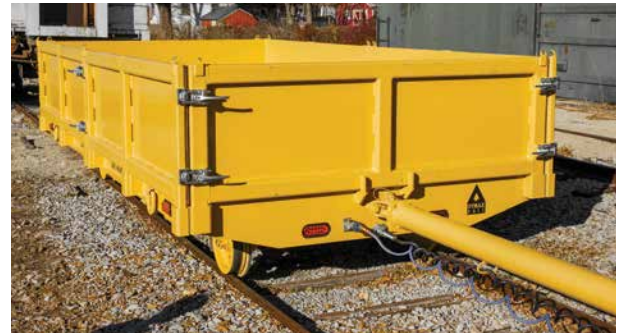
Optional gondola side walls

Dymax Rail offers trailers suited for use with Road Rail Machinery such as Grapple Trucks and Excavators. These trailers are 8' x 16' size and feature numerous options such as park or air brake kit, solar powered direction detection lighting, tie down locations, stake pockets or panel walls.